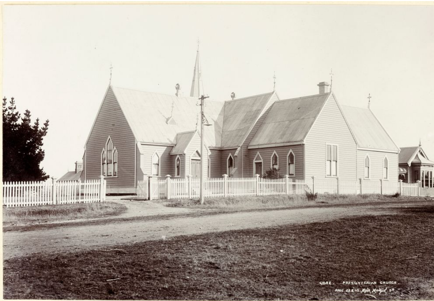
Church before hall erected, c.1903. Te Papa Tongarewa.