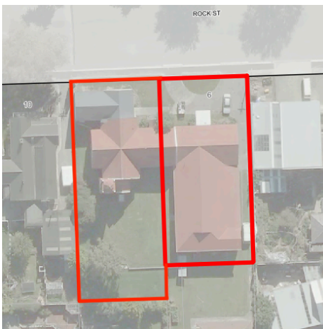
Extent of scheduling, former East Gore Presbyterian Church, 6 Rock Street, Gore.